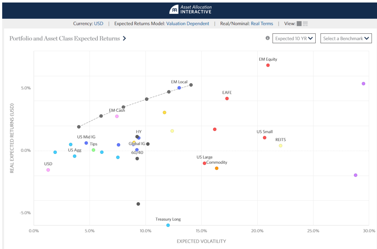
1 Source: https://interactive.researchaffiliates.com/asset-allocation#!/?currency=USD&model=ER&scale=LINEAR&terms=REAL

This example shows expected 10 year real returns in USD for a variety of asset classes calculated by Research Affiliates, a well-regarded quantitative analysis firm. Note that their expected returns for US Large stocks is -1.0% per annum.